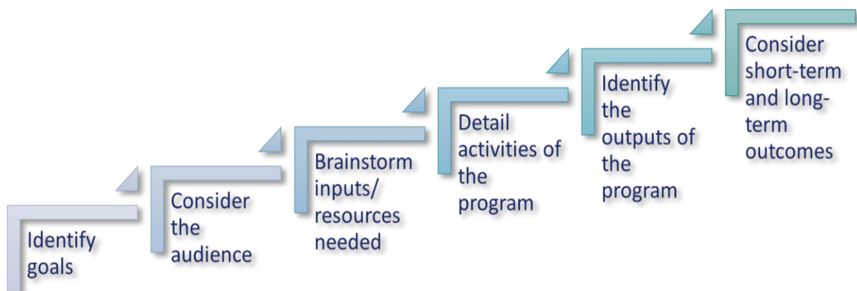
Figure 1: This figure shows steps that are considerations when developing a logic model for a program grounded in a Theory of Change (29, 30)

Programs grounded in theory are most effective (23, 26-28); in particular, 87% of programs targeting social isolation that have a theoretical basis are successful in improving social participation (26), (27). One method for grounding programs in theory is developing a Theory of Change to plan short-term and long-term outcomes. This is an approach that illustrates why and how a change is expected to take place. By doing so, achievable goals can be formed via proposed intermediate outcomes. During this process relevant stakeholders would be identified, which will further improve the usability and degree of fit of the programs. A logic model is a visual or point-form tool that some organizers use to plan programs (Figure 1) (29).